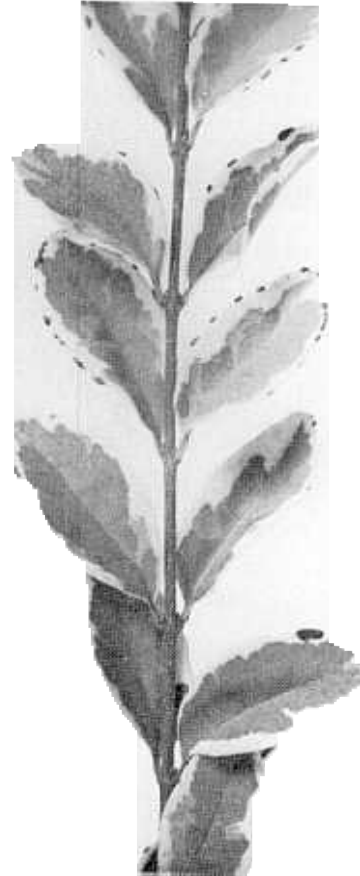
Fig. 2. Leaves of L. sinense devoid of sooty mold (and scale insects).

Traditionally, sooty molds have been regarded as deriving their sustenance from honeydew excreted by aphids, coccoids, and many other sap-sucking insects. Insects usually infest lower leaf surfaces, and sooty molds usually infest upper leaf surfaces, reflecting the fact that insects on the lower leaf surfaces excrete honeydew which falls to the upper leaf surfaces. Honeydew has been analyzed and has been found to contain