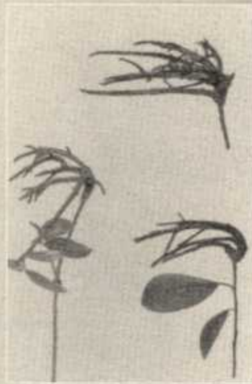
(Top left) Silhouette of a holly tree seriously debilitated by Sphaeropsis tumefaciens .