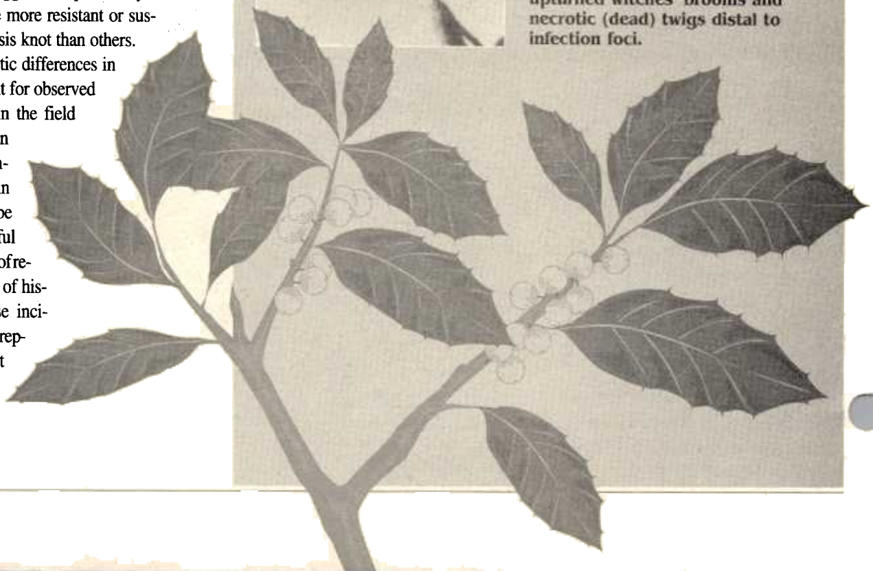
(Above) Small holly branchlets infected by Sphaeropsis tumefaciens . Note swellings, upturned witches' brooms and necrotic (dead) twigs distal to infection foci.