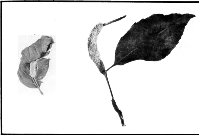
Fig. 1. Leaf distortion, petiole hypertrophy and aecial sporulation resulting from infections of Puccinia sparganioides on green ash. (DPI Photo #702738)

In general, ash rust is not of economic significance. However, infections have occasionally resulted in widespread defoliation of white ash ( Fraxinus americana L.) in natural stands, urban settings, and nurseries in parts of eastern Canada (4, 5). Severe damage has also been reported on ashes in South Dakota (3). Indeed, rust-induced defoliations occurring over two or more successive years have reportedly contributed to the decline and death of some trees (5).